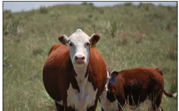
Snowshoe 40E Serena E90 H30 - Dam of 91K