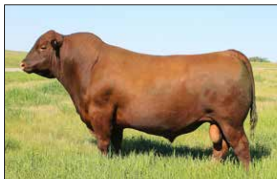
Bieber Let's Roll B 563 - Sire of 04K