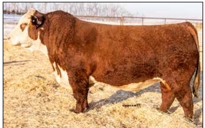
TH Masterplan 183F Sire of lots 04K, 07K, 09K, 10K, 13K, 14K, 15K, 16K, and 37K