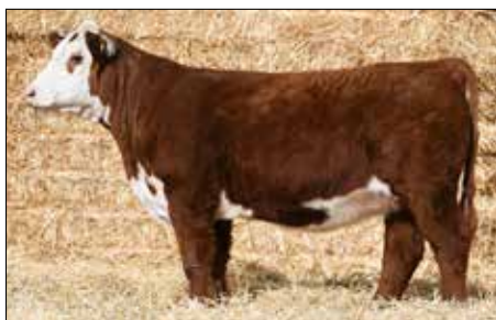
Snowshoe 134F Lady G30 J84 Daughter of 134F - Purchased by the Camp Family, MS in our 2022 Sale