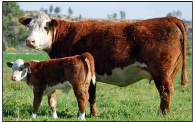
Snowshoe 719T Fiona Y14 - Dam of lot 144J