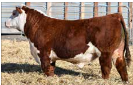
Snowshoe Benchmark D40 79G - Maternal Brother to lot 80K