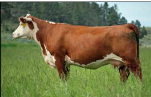
Snowshoe P606 Serena T44 ET Maternal Great Granddam of lot 153J