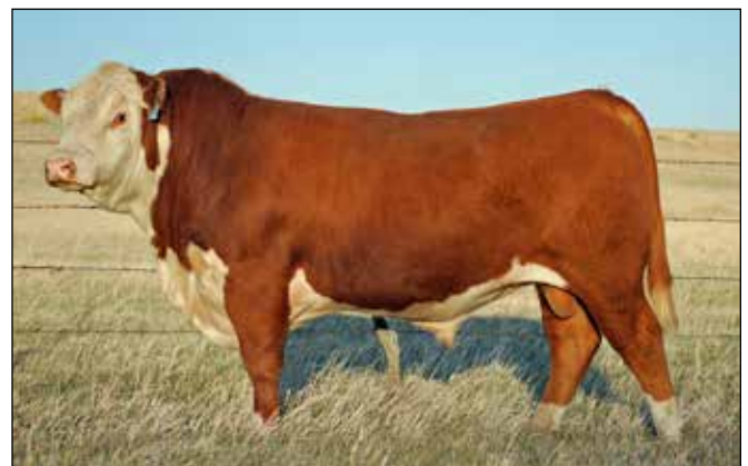
Snowshoe 32D Granite C25 82F - Sire of lots 21J and 55J Owned with Keltner Ranch, MT