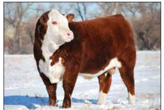
Snowshoe X51 Bannack Y27 19C Sire of lots 23K, 36K, and 71K