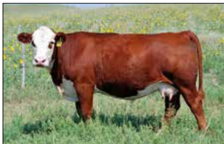
Snowshoe 90X Tori A78 E73 - Dam of lot 81K