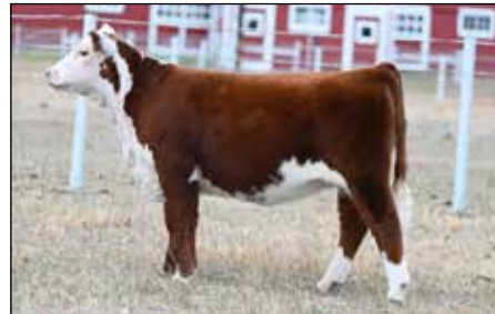
Snowshoe 81E Fiona G43 K26 Daughter of 81E - Purchased by Narjes Cattle Co, NE in the Elite 8 Sale