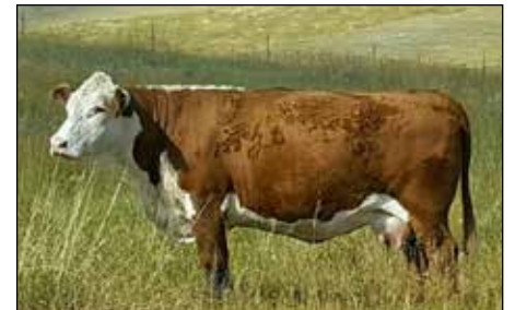
Snowshoe P606 Pilar U09 - Maternal Great Granddam of lot 105J