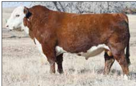
JDH 21Z Victor 33Z 40E ET - Sire of lot 105J