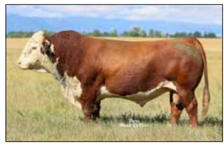
Snowshoe 719T Paterno 23Y - Maternal Grand Sire of 105J and 132J, Maternal Great Grand Sire of 135J