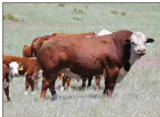
Snowshoe 19C Outlaw U59 101F Sire of lots 44K, 48K, 79K, 83K, 86K, 89K, and 98K