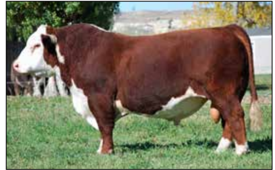
Snowshoe 31U Tuff 31S 42Z - Sire of lot 135J