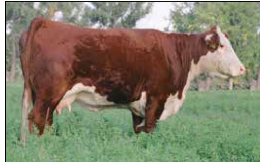
BSB 28E Lolita L3 - Maternal Granddam to 95J