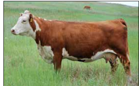
Snowshoe P606 Selena U06 Maternal Great Granddam of 20K