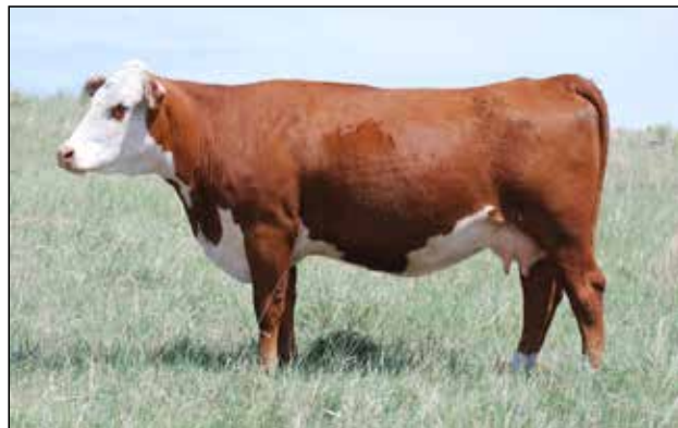
Snowshoe 10Y Sapphire B12 F60 - Dam of 65K