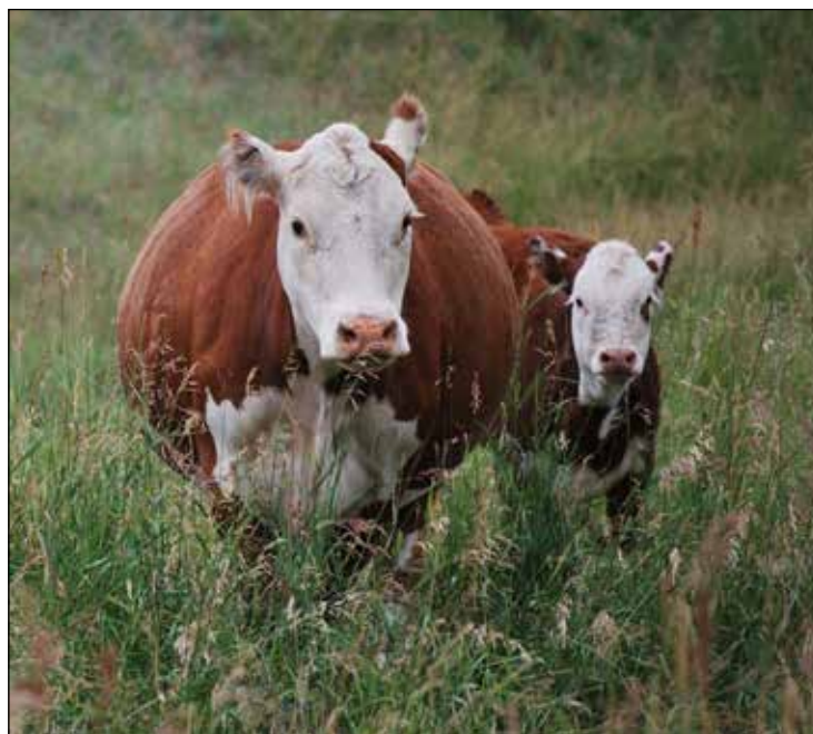
Snowshoe 483T Sapphire T12 B12 - Maternal Granddam of lot 65K