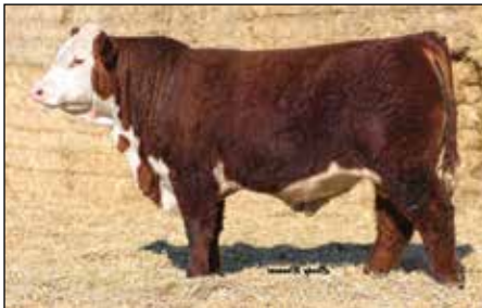
Snowshoe 81E Historic H09 20K Son of 81E Selling Sale Day