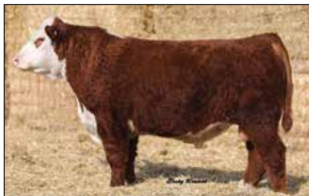
Snowshoe 101 Outlaw D14 171J Son of 101F Selling Sale Day