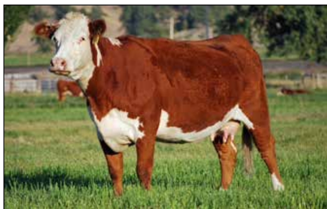
Snowshoe P606 Mystic Boom 34R ET Maternal Granddam of lot 09K