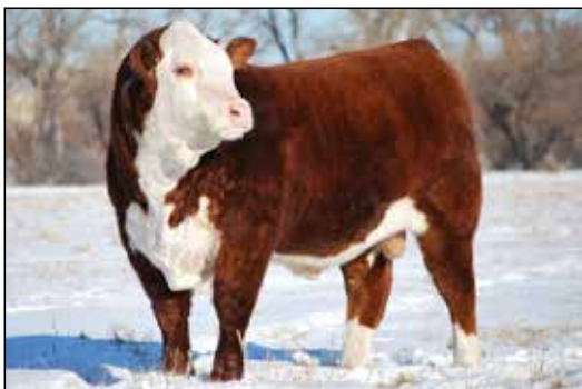
Snowshoe X51 Bannack Y27 19C - Sire of lot 23K