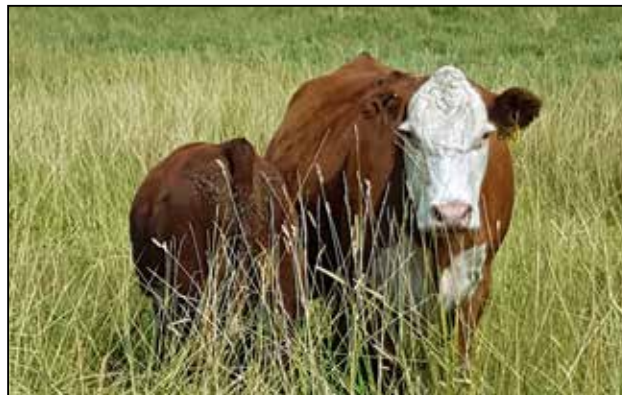
Snowshoe 90X Mystic 28R B40 with 15K at side Dam of 15K