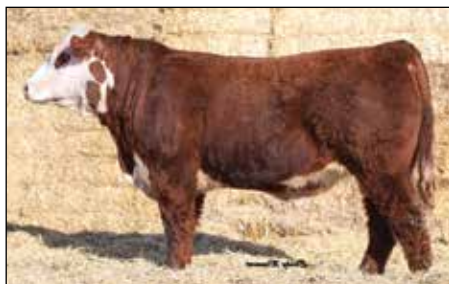
Snowshoe Masterplan 06E 04K Son of 183F Selling Sale Day

Can't Join Us? Bid Live on The Livestock Link Livestock Videoing - Video Sales • Bid-by-Click Online Sales To view events go to: www.TheLivestockLink.com