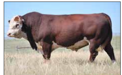
TH 49B 358C Drover 134F - Sire of 81K