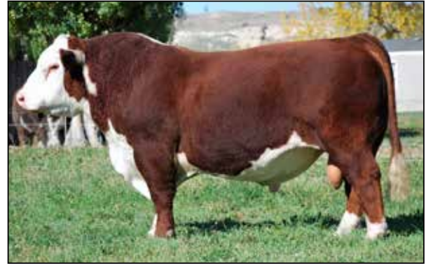
Snowshoe 31U Tuff 31S 42Z - Sire of lot 153J