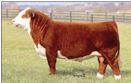
Boyd 31Z Blueprint 6153 - Maternal Grand Sire of 23K

34K A REG: 44394105 DOB: 2/26/22 Polled SNOWSHOE 81E HISTORIC G14 34K