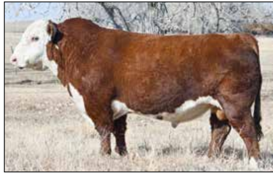
JDH 21Z Victor 33Z 40E ET - Full Sib to Dam of 04K