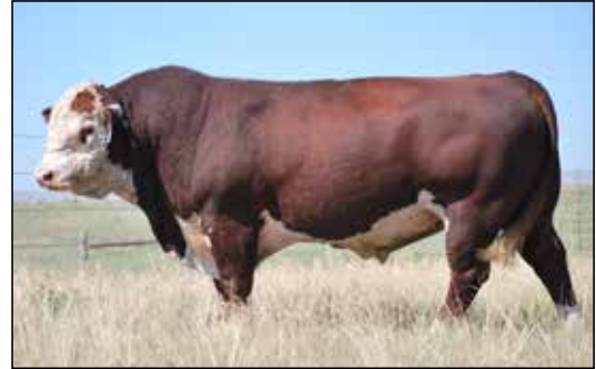
TH 49B 358C Drover 134F - Sire of lot 70K