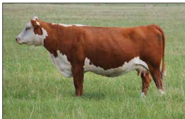
Snowshoe 23Y Perfect Miss C39 Dam of lot 14K