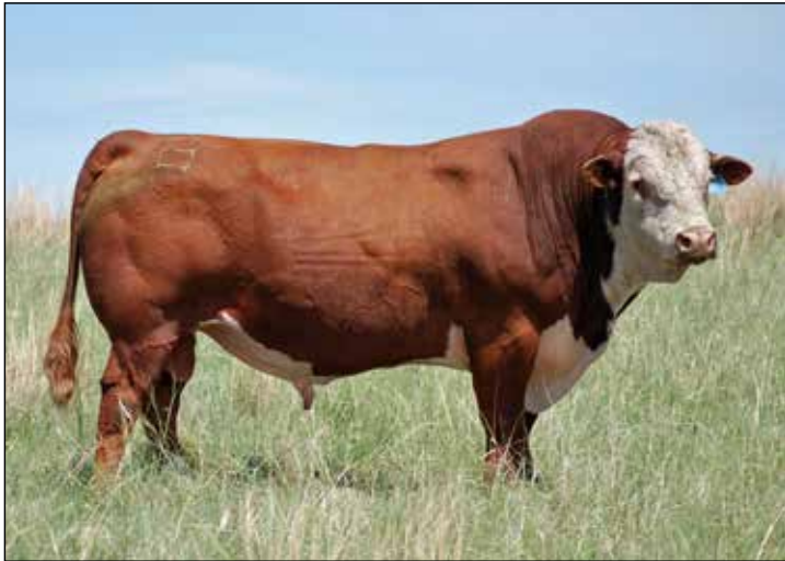
Snowshoe 19C Outlaw U59 101F - Sire of lots 95J and 96J