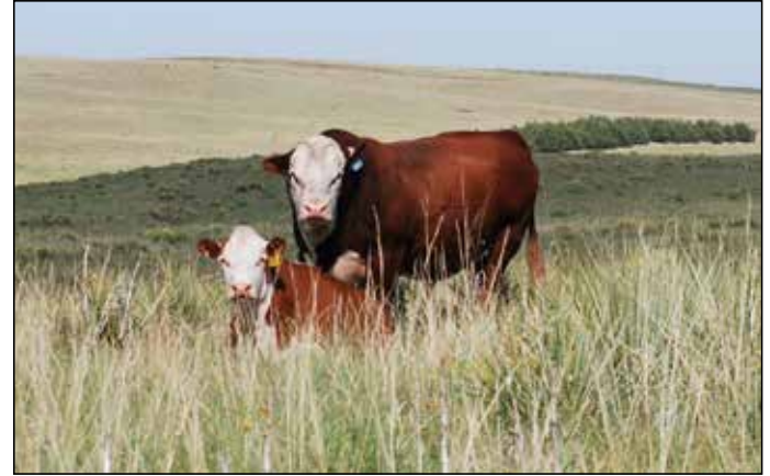
Snowshoe 19C Outlaw U59 101F - Sire of lot 164J, 165J and 171J