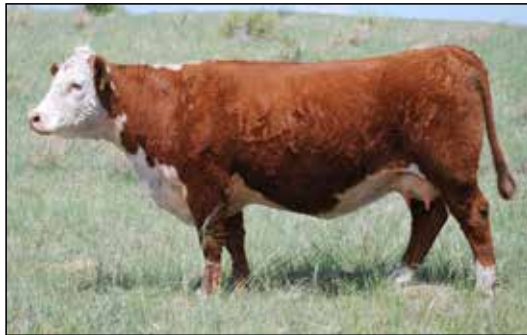
Snowshoe 15B Fiona Y14 E89 - Dam of lot 10K