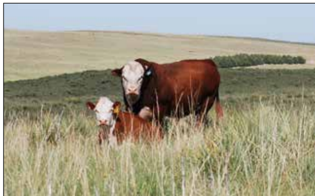
Snowshoe 19C Outlaw U59 101F Sire of lots 44K, 48K, 79K, 83K, 86K, 89K, and 98K