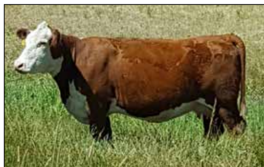
Snowshoe 31U Breeze T24 Z30 Maternal Granddam to lots 08K, 43K and 47K