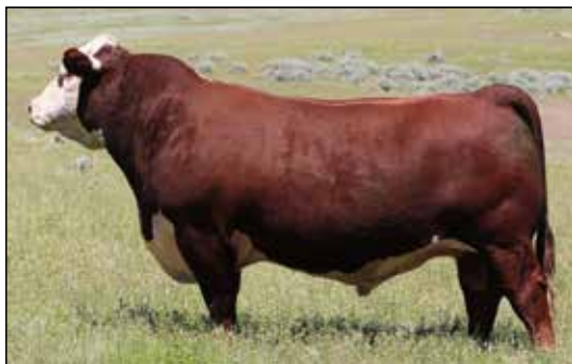
NJW 76S 27A Long Range 203D ET - Sire of lot 136J