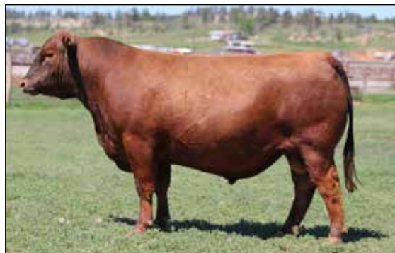
5L Genuine 1603-195C - Sire of lots 06K and 07K