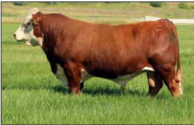
NJW 160B 028X Historic 81E ET Sire of lots 128J, 132J, 139J, 149J, 150J, and 165