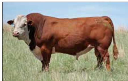
Snowshoe 19C Outlaw U59 101F Sire of lots 44K, 48K, 79K, 83K, 86K, 89K, and 98K

Visit SnowshoeCattle.com for Videos and Supplemental Information