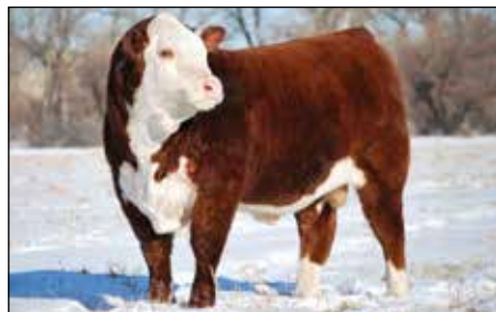
Snowshoe x51 Bannack Y27 19C Sire of 101F