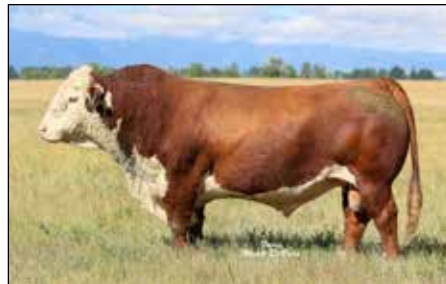
Snowshoe 719T Paterno 23Y Maternal Grand sire of lot 105J