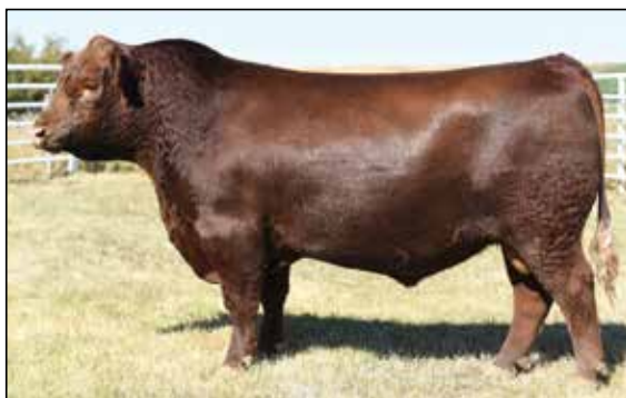
LSF SRR Identity 0295H - Sire of lot 01K

02K REG: 4647015 DOB: 2/3/22 Cat: 1A MPPA: 102