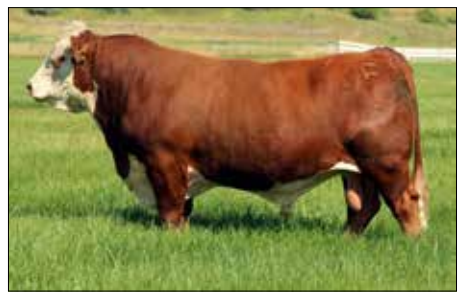
NJW 160B 028X Historic 81E ET Sire of lots 128J, 132J, 139J, 149J, 150J, and 165J