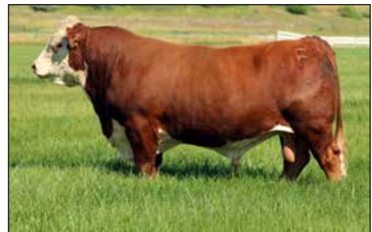
NJW 160B 028X Historic 81E ET Sire of lots 20K, 21K, 33K, and 34K