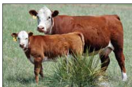
Snowshoe 134F Breeze E14 H24 Daughter of 134F and Full Sister to lot 08K